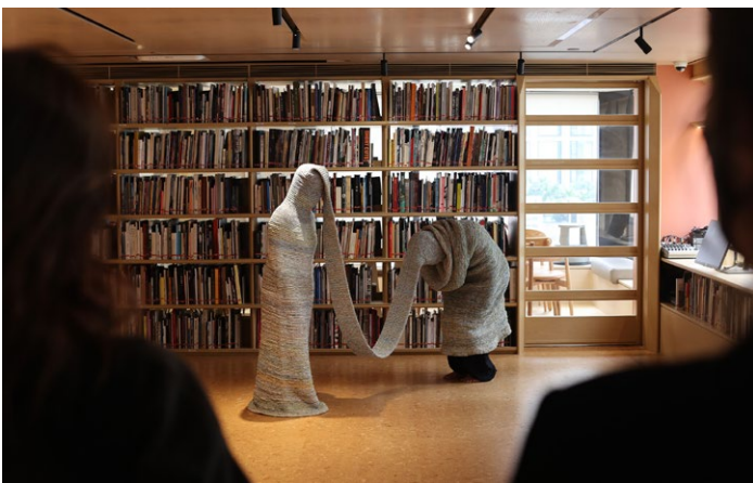
(Two top images) Beyond the Surface , 2024 - ongoing Knitted shredded travel documents 800 x 15 x 5 cm / 315 x 5 7/8 x 2 in