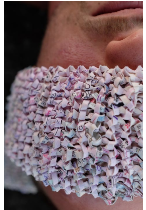
Beyond the Surface , 2024 - ongoing Knitted, shredded travel documents 800 x 15 x 5 cm / 315 x 5 7/8 x 2 in

In Questioning the Line (2023-ongoing), Chen and a dancer subvert human divisions through performance. Inside Chen's interconnected Body Container , they form a living statue periodically during the exhibition*, using movement and stillness to explore human relationships, both with each other and the landscapes they inhabit. Chen has performed this piece in nature and across the world, fostering shared experiences that transcend geopolitical borders, a theme reflected in the maps that serve as the material of the work.