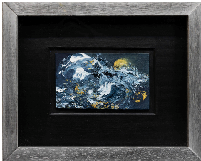
Maggi Hambling, Wave & Rising Moon , 2024, Oil on board, 7.5 x 12.5 cm

Established in 1974 at Flowers Gallery, Small is Beautiful invites selected contemporary artists from various disciplines to showcase works with a fixed economy of scale, each piece measuring no more than 7 x 9 inches. In keeping with this tradition, the 42nd edition of the exhibition will feature over 100 artists, continuing to offer a unique opportunity to acquire smaller-scale works from internationally acclaimed artists, as well as to discover and explore emerging talents.