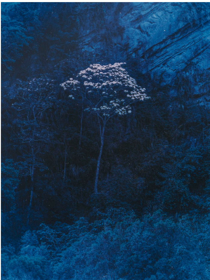
Cody Cobb, CC23.1937 , 2023, C-type print facemounted to acrylic 22.6 x 17.5 cm