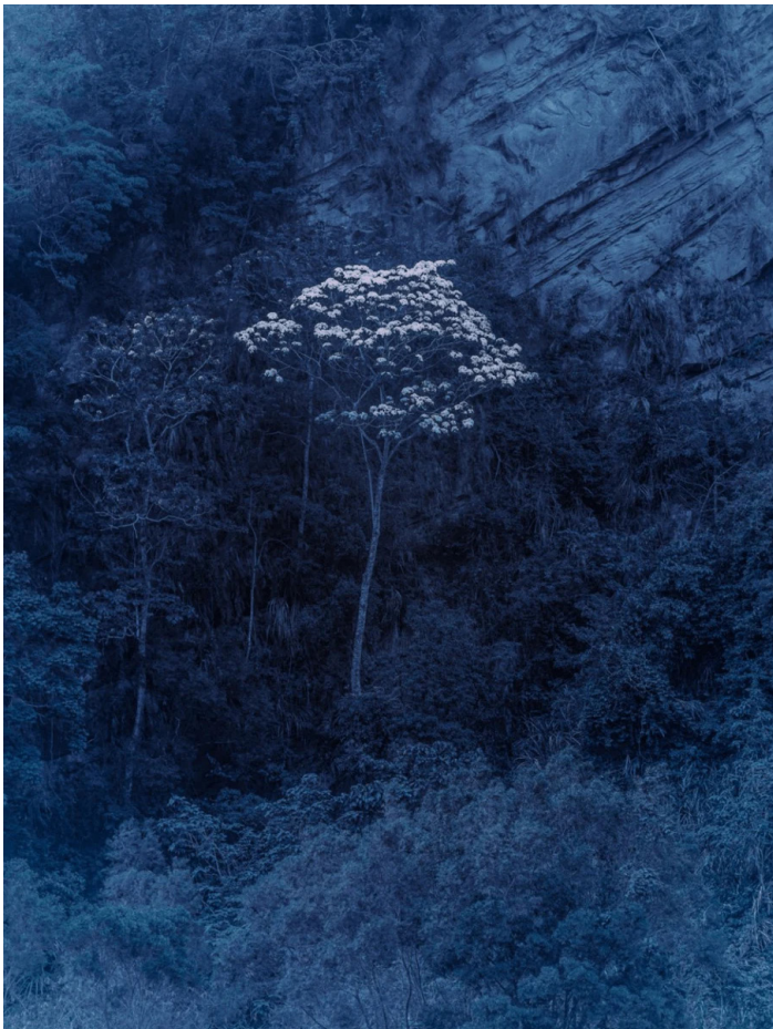
Cody Cobb, CC23.1937 , 2023, C-type print facemounted to acrylic 22.6 x 17.5 cm