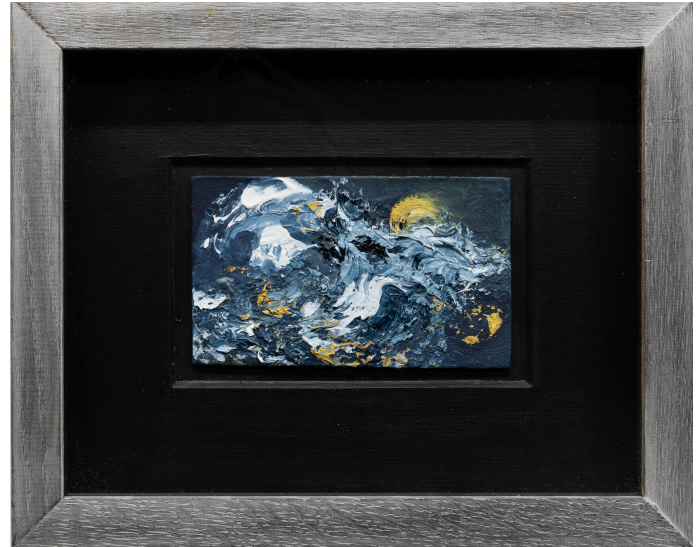
Maggi Hambling, Wave & Rising Moon , 2024, Oil on board, 7.5 x 12.5 cm

Established in 1974 at Flowers Gallery, Small is Beautiful invites selected contemporary artists from various disciplines to showcase works with a fixed economy of scale, each piece measuring no more than 7 x 9 inches. In keeping with this tradition, the 42nd edition of the exhibition will feature over 100 artists, continuing to offer a unique opportunity to acquire smaller-scale works from internationally acclaimed artists, as well as to discover and explore emerging talents.