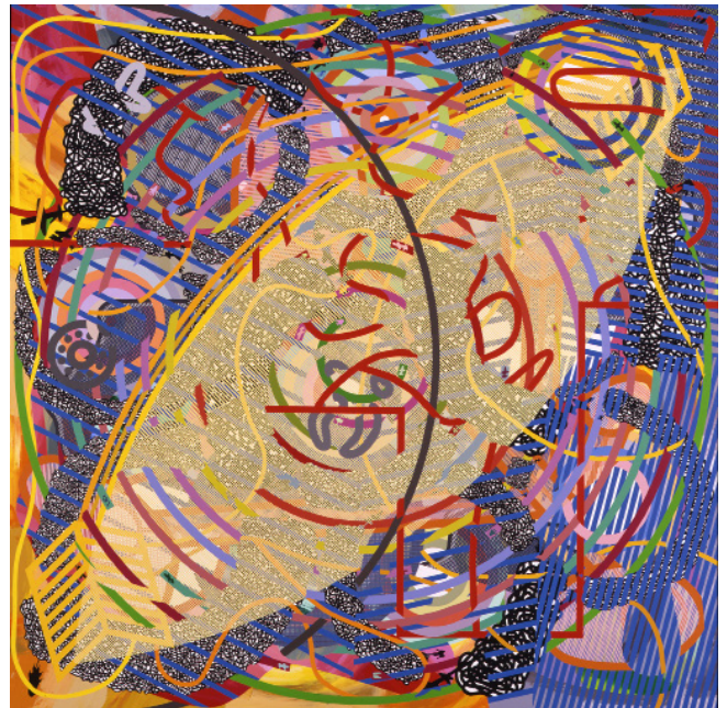
Bernard Cohen, Spinning - Weaving , 1992-93, Acrylic on linen, 183 x 183 cm, 72 x 72 in