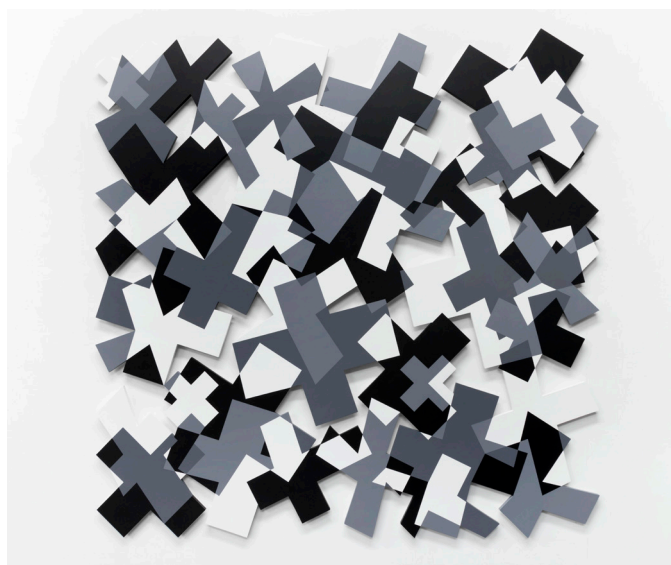
Nathan Cohen, Crossings , 2014, Acrylic paint on cut panel, 142 x 142 x 2.5 cm, 55 7/8 x 55 7/8 x 1 in

Flowers Gallery is pleased to present an exhibition of works by Bernard Cohen and Nathan Cohen, exhibiting together for the first time. The exhibition Two Journeys focuses on both father and son's common quest for discovery through painting, where experience is translated through distinct forms and working processes.