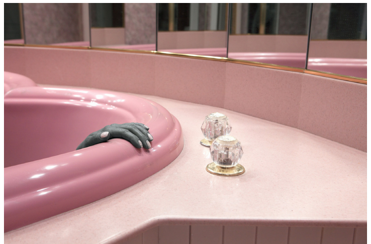
Juno Calypso, Seaweed Wrap , 2015