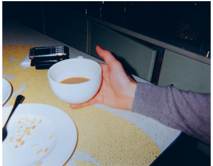
Natasha Caruana, Primrose Hill #2 , 2008-09