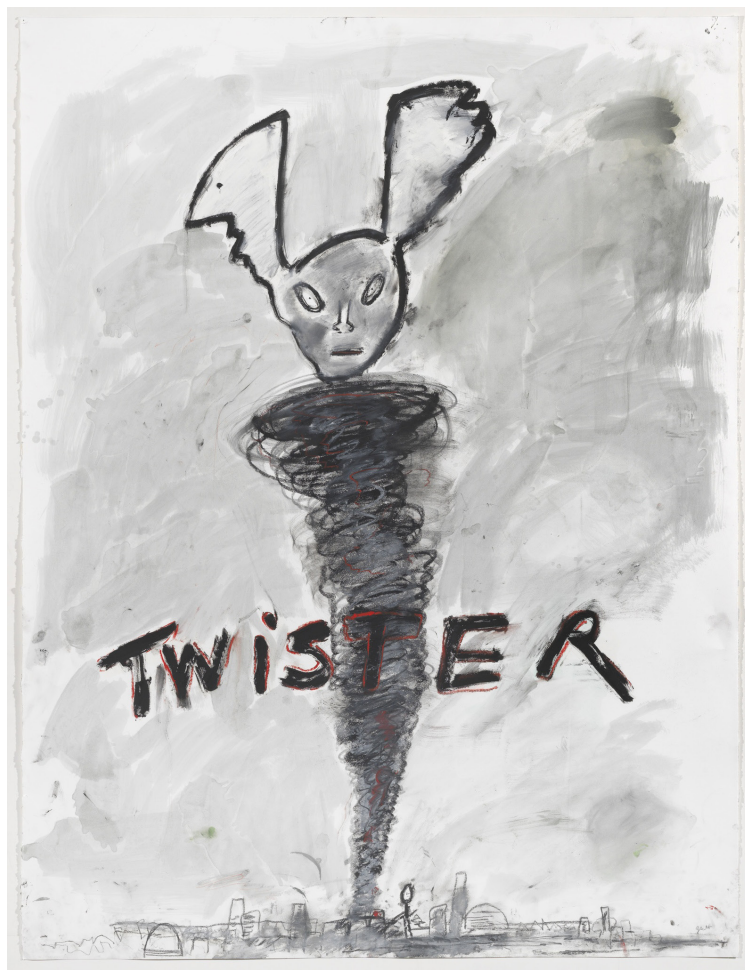
Twister , 2015 Acrylic and oil pastel on paper 50 x 38 in