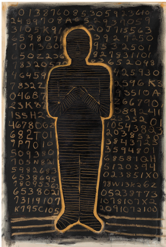
Attempted Eternity (Gold) , 2015 Oil, acrylic and oil pastel on canvas 67 x 44 1/4 in

For further information and images please contact Brent Beamon on brent@flowersgallery.com or 212 439 1700.