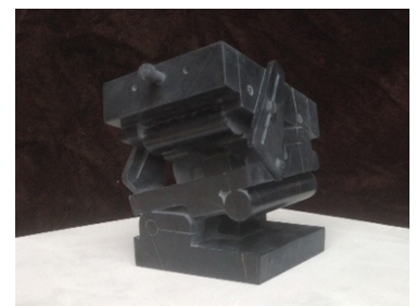
Peter Glenn Oakley, Sine Plate , 2015, Hand carved black marble, 4 1/2 x 4 x 4 1/2 in

Peter Glenn Oakley (b. 1974) is a stone sculptor from North Carolina. He works mostly with black and white marble, carving realistic life-size sculptures that reference industrial objects. Oakley's subjects are selected from our recent industrial past: sewing machines, typewriters, Styrofoam, engines, cassette tapes, guns, etc. The choice of marble as the medium references the historical marble sculptures of gods and goddess, yet it also conveys a shift in society where technology rules our lives just like the pantheons ruled the lives of our ancestors. Oakley has exhibited at and is collected by the North Carolina Museum of Art, Raleigh, NC and the Crystal Bridges Museum of American Art, Bentonville, AR.