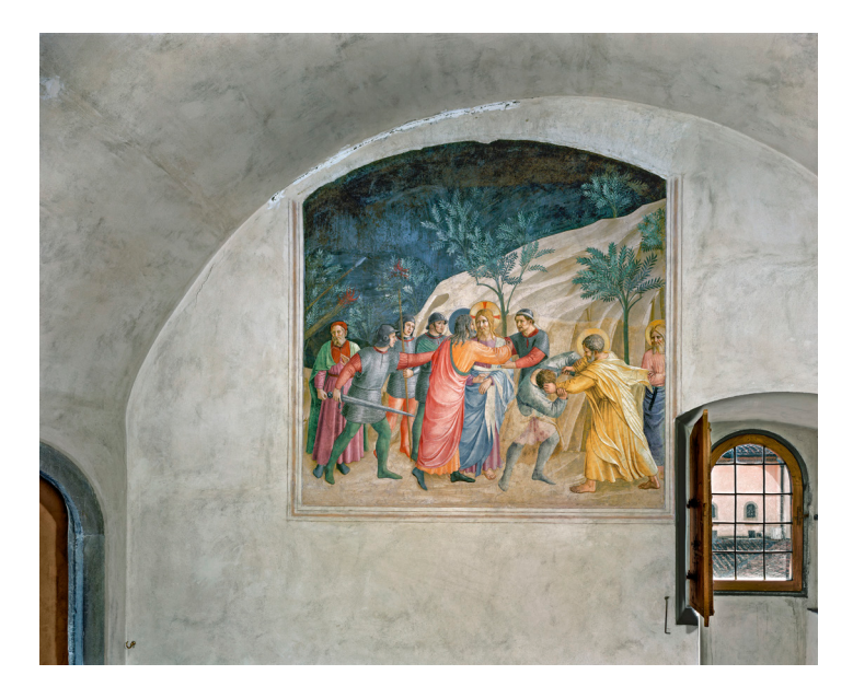
Clockwise from top left: Crucifixion with the Virgin and Saints Cosmas, John the Evangelist and Peter Martyr by Fra Angelico, 2010, archival pigment print; Adoration of the Magi and Man of Sorrows by Fra Angelico, Cell 39, Museum of San Marco Convent, Florence, Italy, 2010, archival pigment print; The Capture of Christ by Fra Angelico, Cell 33, Museum of San Marco Convent, Florence, Italy, 2010, archival pigment print.