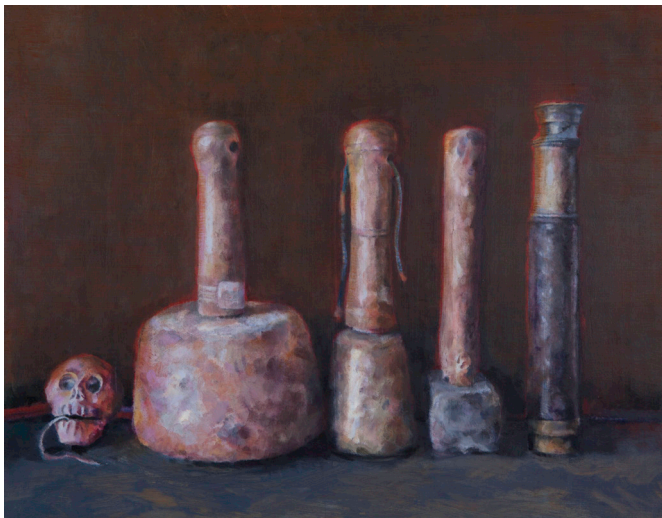
Father Altar , 2014, Oil on wood, 26 x 33 cm