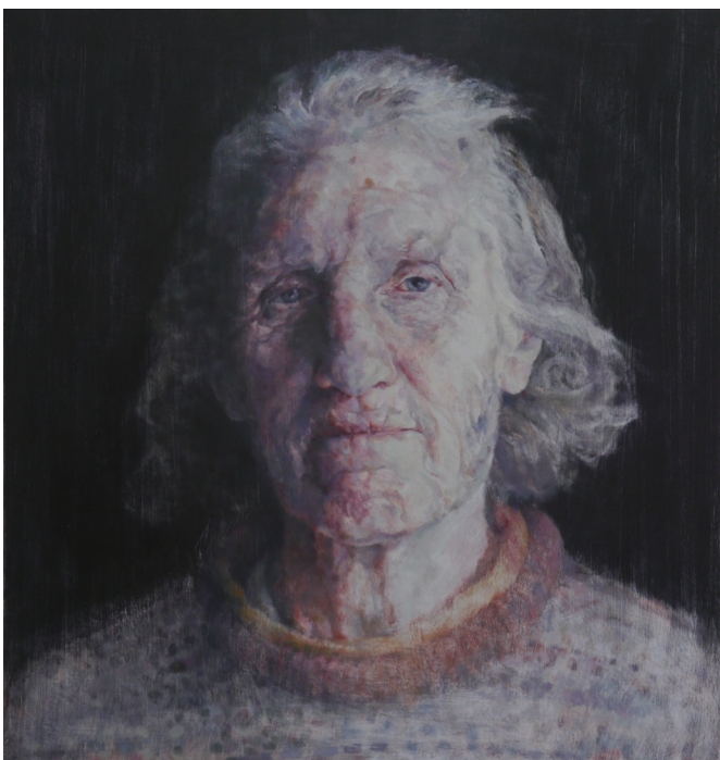
After the Dressing Up II , 2014, Oil on wood panel, 42 x 40.5 cm