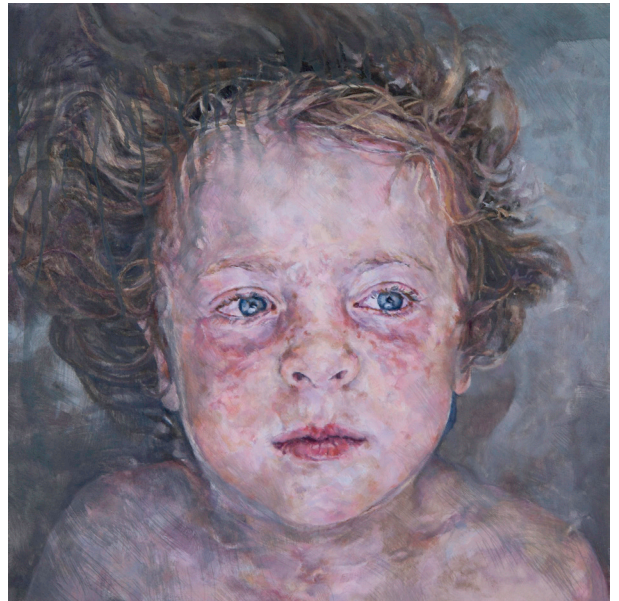
Surfacing , 2014, Oil on canvas, 33.5 x 33.5 cm

The Passage paintings evoke instances of lucidity within the small, often overlooked details of domestic life. These include Surfacing , which depicts the face of a young child emerging from water in the bath, and the triptych After the Dressing Up , which honours the gaze of three elderly women. Displayed alongside the portraits are pared-down still life compositions, through which Payne enquires into the relationship between memory and our attachment to domestic objects. In Mother Altar and Father Altar a selection of care-worn tools and trinkets on mantelpieces can be seen to stand in for the people themselves. Payne is interested here in 'enshrinement' within the home, and questions how we, as a species, invest emotionally in our environment through narrative.