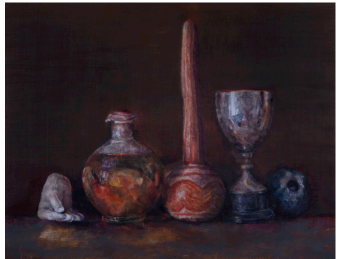
Mother Altar , 2014, Oil on wood, 26 x 33 cm