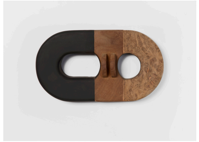
Of Giving and Receiving, Stomach , 2013, Wood, 31 x 17 cm