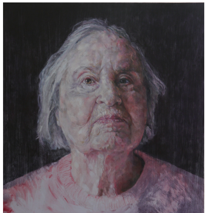
After the Dressing Up III , 2014, Oil on wood panel, 42 x 40.5 cm

Opening Hours: Monday - Saturday 10am - 6pm or by appointment All images ©Freya Payne, courtesy of Flowers Gallery London and New York