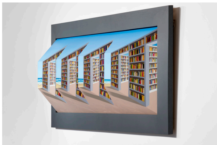
Reverspective in Perspective , 2017, Oil on board construction, Framed: 24 3/4 x 48 1/8 (diminishing to 15 3/4 right) x 7 1/8 in