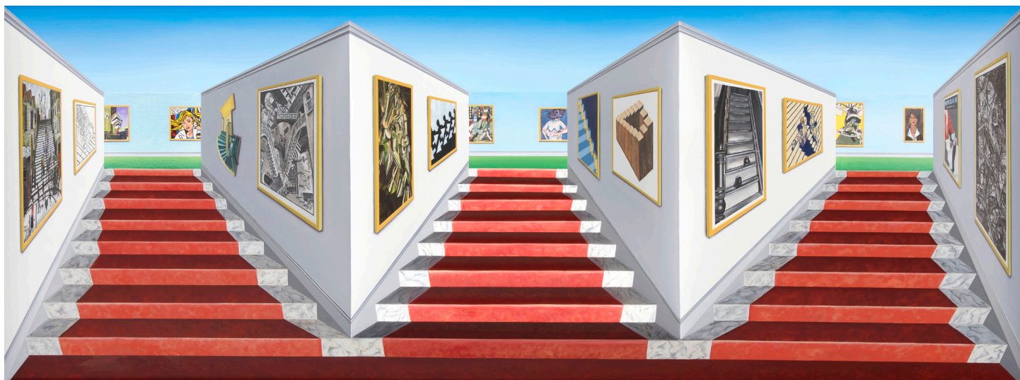
Steps to the Stars , 2017, Oil on board construction, 23 7/8 x 63 x 9 7/8 in, Framed: 30 7/8 x 70 1/8 x 10 5/8 in

newyork@flowersgallery.com www.flowersgallery.com