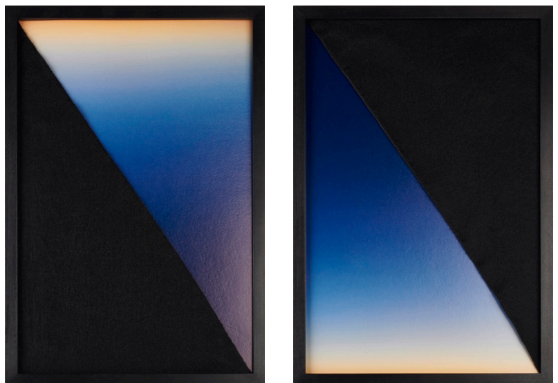
Clock Work , 2019, clock, hole, arm & time, durational performance; Untitled Drape #2 & Untitled Drape #3 , 2019, unique collage, colour photograph and felt drapery, 23cm x 33cm

For high res images please contact Hannah Hughes: 0207 920 7777 / hannah@flowersgallery.com