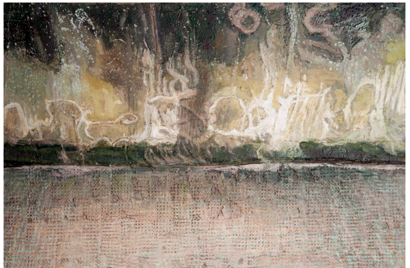
Shock and Awe, 2014, Concrete & acrylic on canvas, 72.5 x 48 cm, 28 1/2 x 18 7/8 in

On the one hand the paintings appear wholly abstract, the opaque tangibility of the concrete holding the eye on the surface; on the other they evoke the vastness of nature and seemingly eternal horizon of the sublime landscape.