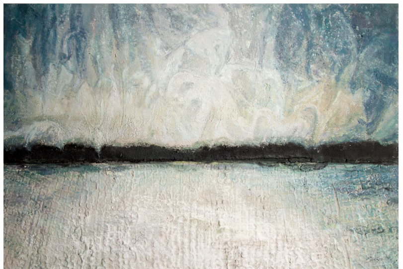
Northern Lights, 2014, Concrete & acrylic on canvas, 71 x 51 cm, 28 x 20 1/8 in