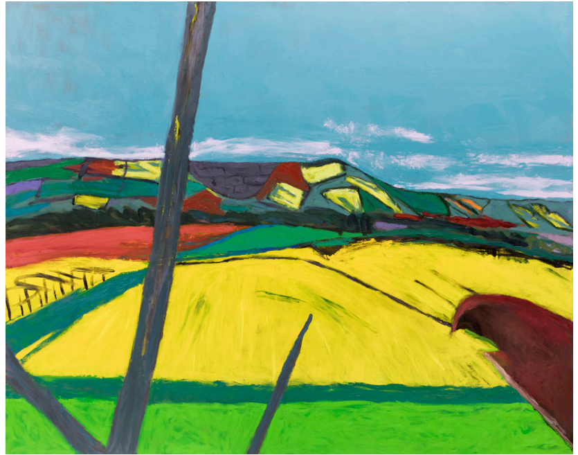
Too Much Yellow , 2018, oil on canvas, 160 x 200cm

British artist Lucy Jones is renowned for her raw, wild landscapes and distinctively provocative self-portraits, characterised by expressive brushwork and bold use of vibrant colour. Balancing an intricate rendering of line and space in her landscapes with the powerful simplicity of her portraits, Jones's paintings conduct a journey through both interior landscapes and the external world beyond.