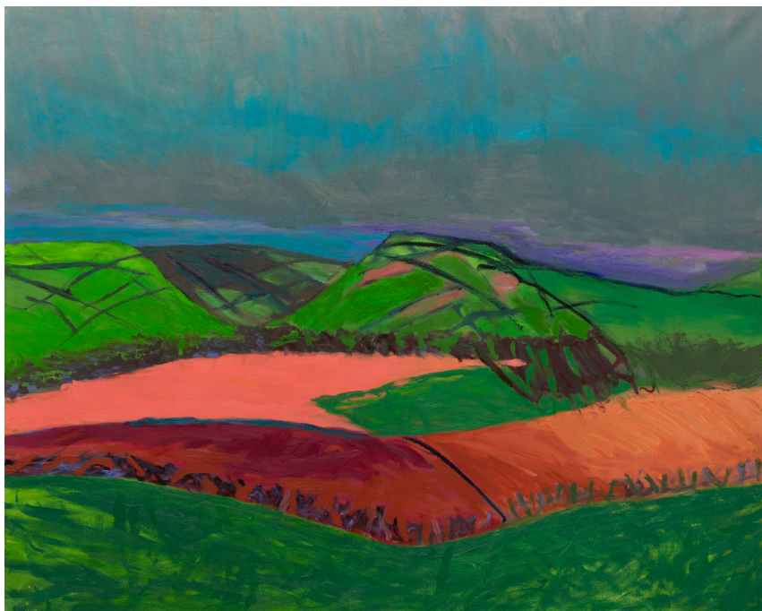
From left: Fields in the Pink , 2018, oil on canvas, 120 x 150cm; With a Handicap Like Yours... , 2018, oil on canvas, 180 x 100 cm.