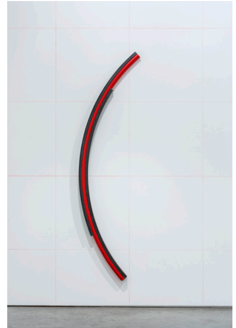
When Paintings Collapse, You Have Beautiful Sculpture 5 (Red) 2013 1/3, Steel, painted steel tube 184 x 44 cm

For further information and images please contact Ceri Stock on 020 7920 7777 or email ceri@flowersgallery.com