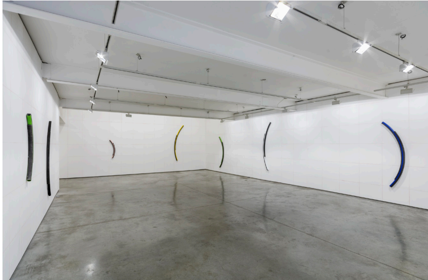
When Paintings Collapse, You Have Beautiful Sculptures, Installation View