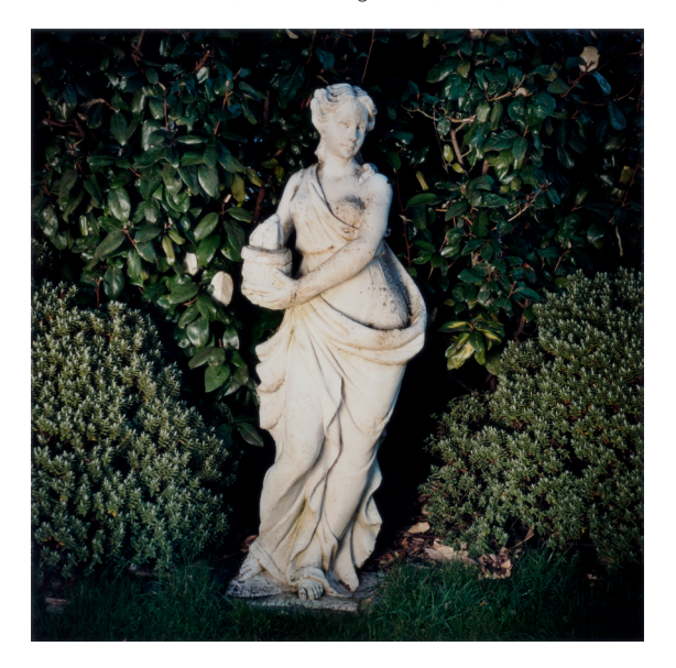
Lucy Levene, Statue 1 , The Sharnbrook Hotel, Bedford, UK, 2013, C-type print, 55cm x 55cm