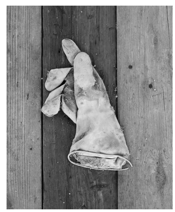
Tereza Zelenkova, Girls and gloves, 2013, 8x Archival Inkjet prints in metal frames, 37x30 cm