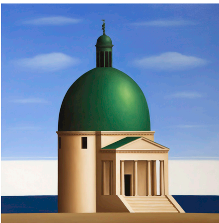
San Simeone Piccolo Blue Sky , 2014, Oil on linen, 29 7/8 x 29 7/8 in

For further information, please contact Brent Beamon - Brent@flowersgallery.com / 212 439 1700.