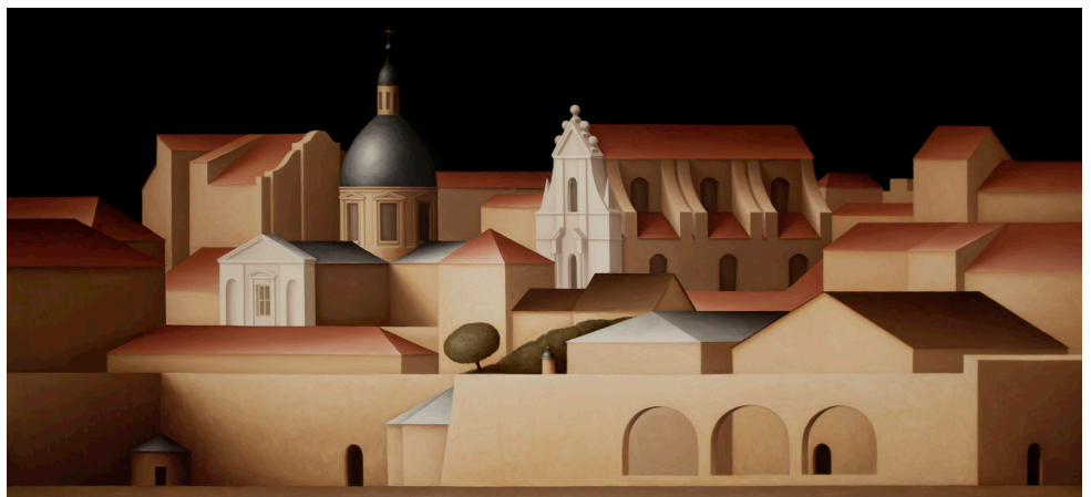
Dubrovnic , 2014, Oil on linen, 31 1/2 x 70 7/8 in