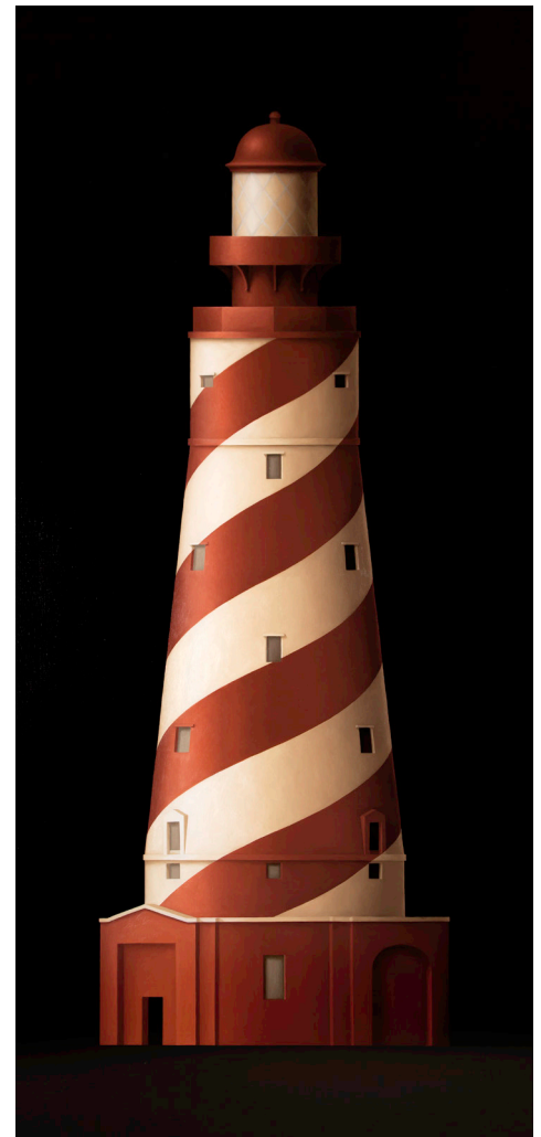
White Shoal , 2013, Oil on linen, 70 7/8 x 31 1/2 in

Renny Tait was born in Scotland and studied at the Edinburgh College of Art, the Royal College of Art, London, and the British School in Rome. His work is included in a number of private and public collections including the Royal College of Art and the Tate Collection.