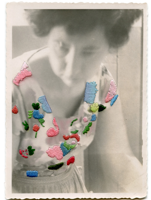
Julie Cockburn, Favourite Dress, 2016 Hand embroidery on found photograph 17.8 x 22.9 cm / 7 x 9 in

This year all of the works from Small is Beautiful will be available to purchase online for the first time, to mark the launch of Flowers Gallery's new online store on 6 December, which will also feature a curated selection of limited edition prints. ( www.flowersgallery.com/shop )