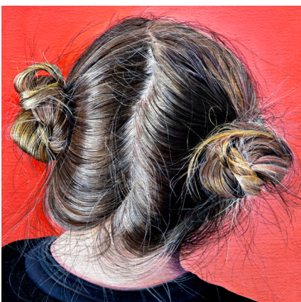
Ishbel Myerscough Hairdo, 2016 Oil on canvas 20.3 x 20.3 cm / 8 x 8 in