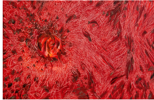
Naomie Kremer Chunnel, 2016 Oil on canvas 15.2 x 22.9 cm / 6 x 9 in