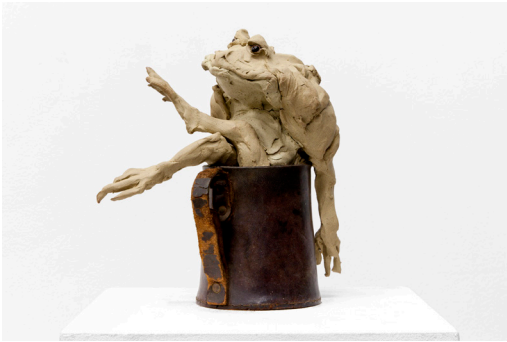
Stephanie Quayle Toad, 2016 Clay 25 x 24 x 8 cm / 9 7/8 x 9 1/2 x 3 1/8 in

For further information, please contact Hannah Hughes - Hannah@flowersgallery.com / 0207 920 7777