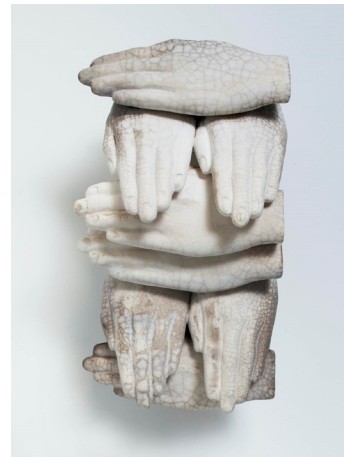
Glenys Barton Gliding II, 1983 Smoked ceramic 17.8 x 9.5 x 5.7 cm / 7 x 3 3/4 x 2 1/4 in